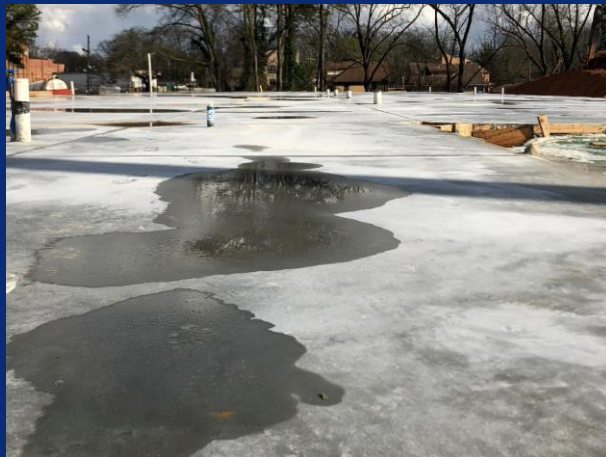
Main level east slab on grade complete