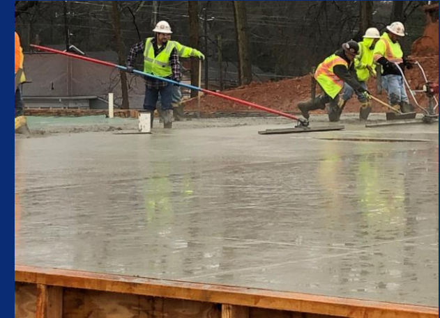
Main level east concrete being installed