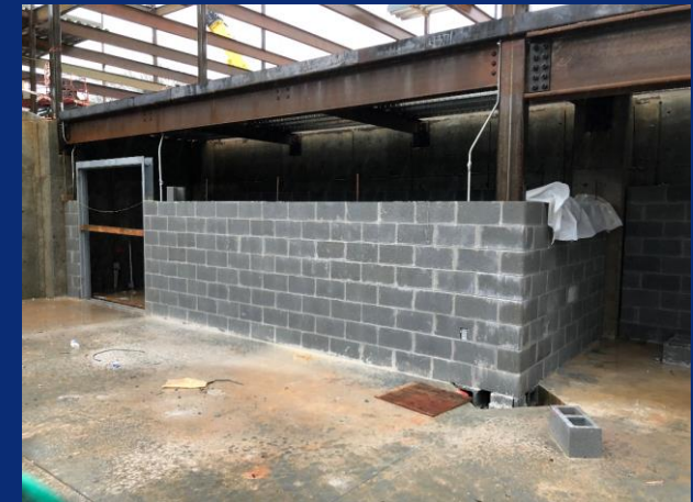
Interior masonry walls beginning in lower level