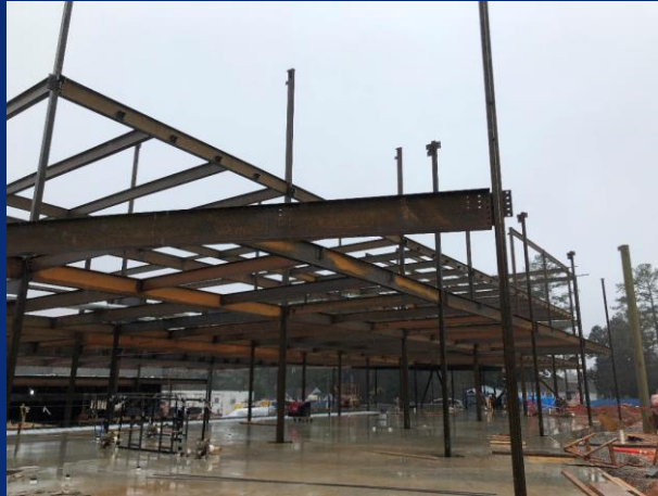
Sequence 2 & 3 steel in progress