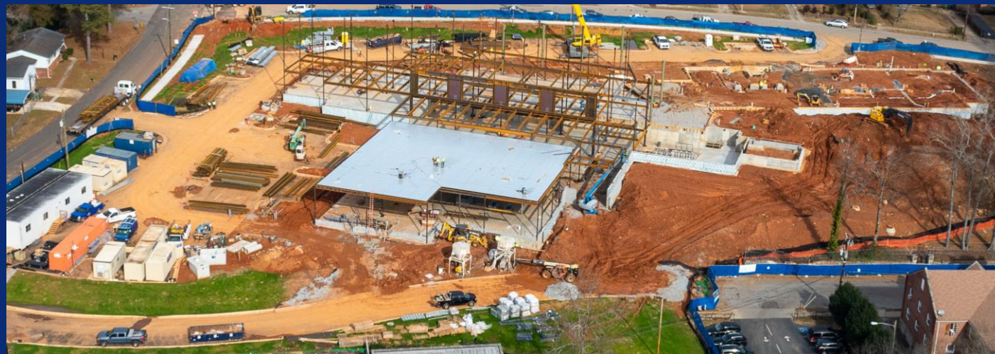
Photo of the project site from South looking North